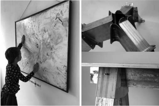
Figure 1. Painting with PLA, Sam Cornwell, ESALA 2017-18. (left). Strategies for Connection - reusing aluminium mullions, Eirini Atmatzidou (2017) and Pablo Sanchez (2018). (right). Tutor: Remo Pedreschi.

One of these projects focused on the waste recovered from the local dredging of canals, which, following dewatering, is otherwise dumped to landfill. The material was first dried and sampled. Having tested its properties and verified its composition (mostly silt, clay, and fine sand), the students then developed several samples, protocols of uses, and prototypes, including a pressed block, a cement stabilised block, a concrete replacement, and extruded clay blocks, which were fired in a kiln by a student with a background in ceramics. However, given the short timeframe of the program, which is only two-semester long, working with external organisations and public corporations such as Scottish Canals presented a number of logistical difficulties, and our focus turned toward the ECA, itself a considerable consumer and producer of waste. Here, students identified waste sources and their potential affordances, in the sense coined by James J. Gibson. 3